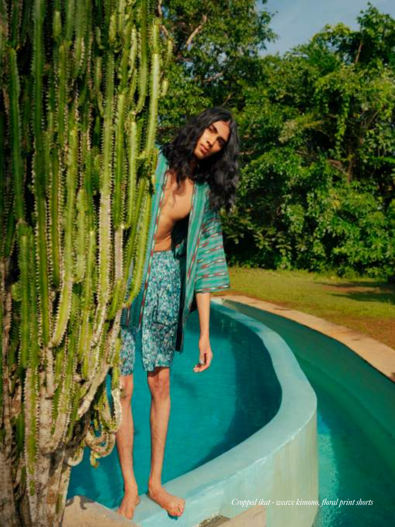
Cropped ikat - weave kimono, floral print shorts