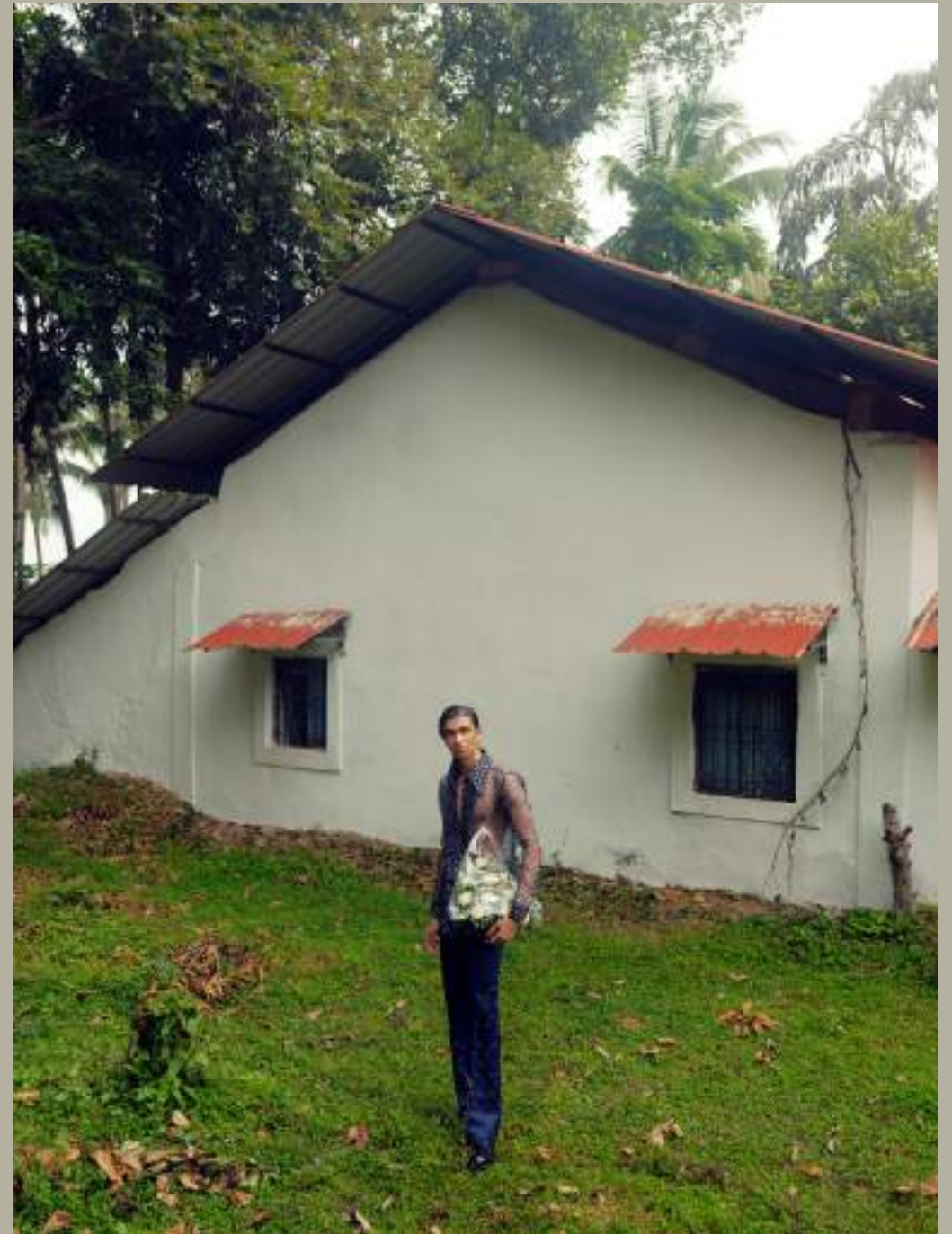
Carpe noctum: seize the night in see-through and a satin finish.