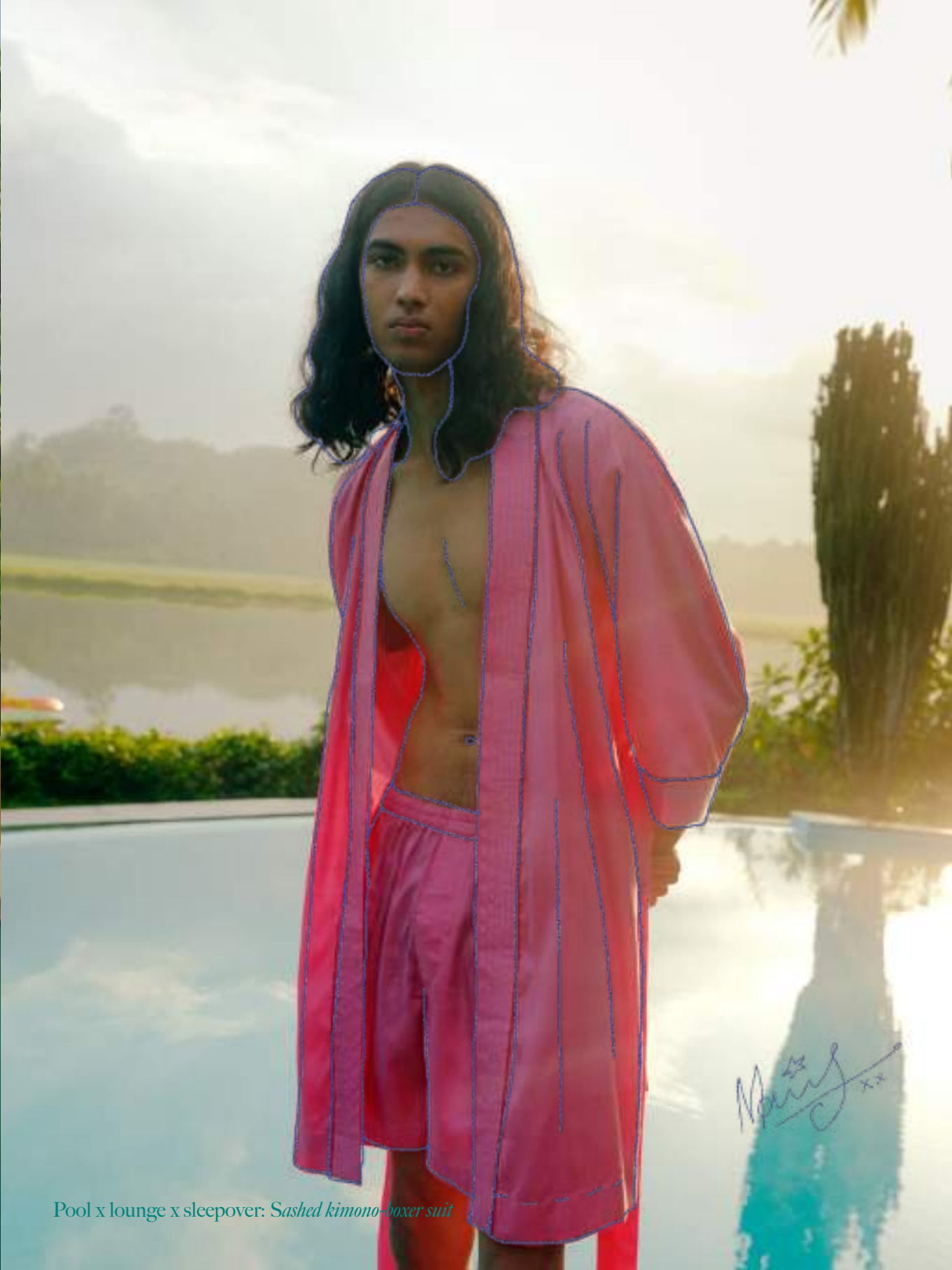
Pool x lounge x sleepover: Sashed kimono-boxer suit